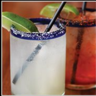
Paloma 13 95 Tequila with a mix of grapefruit soda, and fresh lime juice