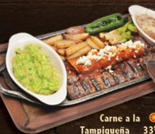
Carne a la ☼ Tampiqueña 33 95 Skirt steak served w/ 1 enchilada, guacamole, rice, beans, and a grilled jalapeño pepper