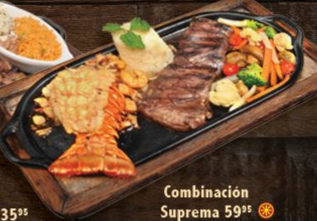
Combinación Suprema 59 95 ☼ Our Signature dish: Lobster tail stuffed with mixed seafood, skirt steak, white rice and vegetables