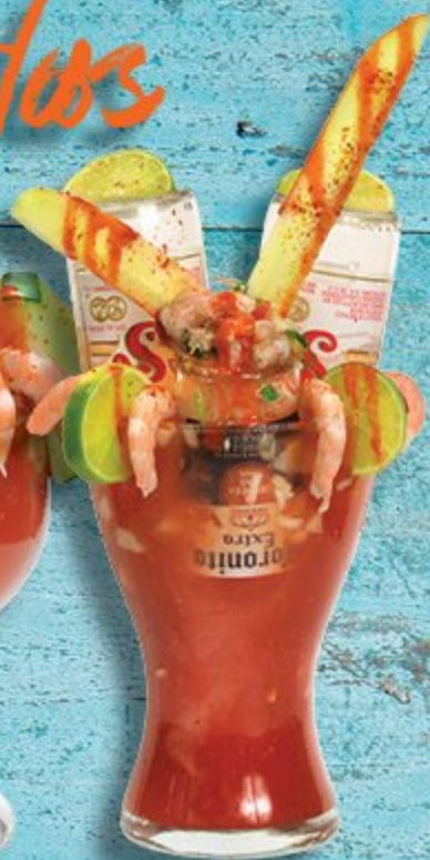
La Chacorta 22.25