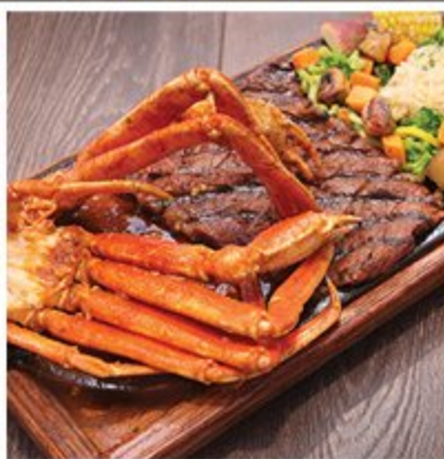
Carne Asada ☼ Con Patas de Jaiba 43 95 Skirt steak with crablegs