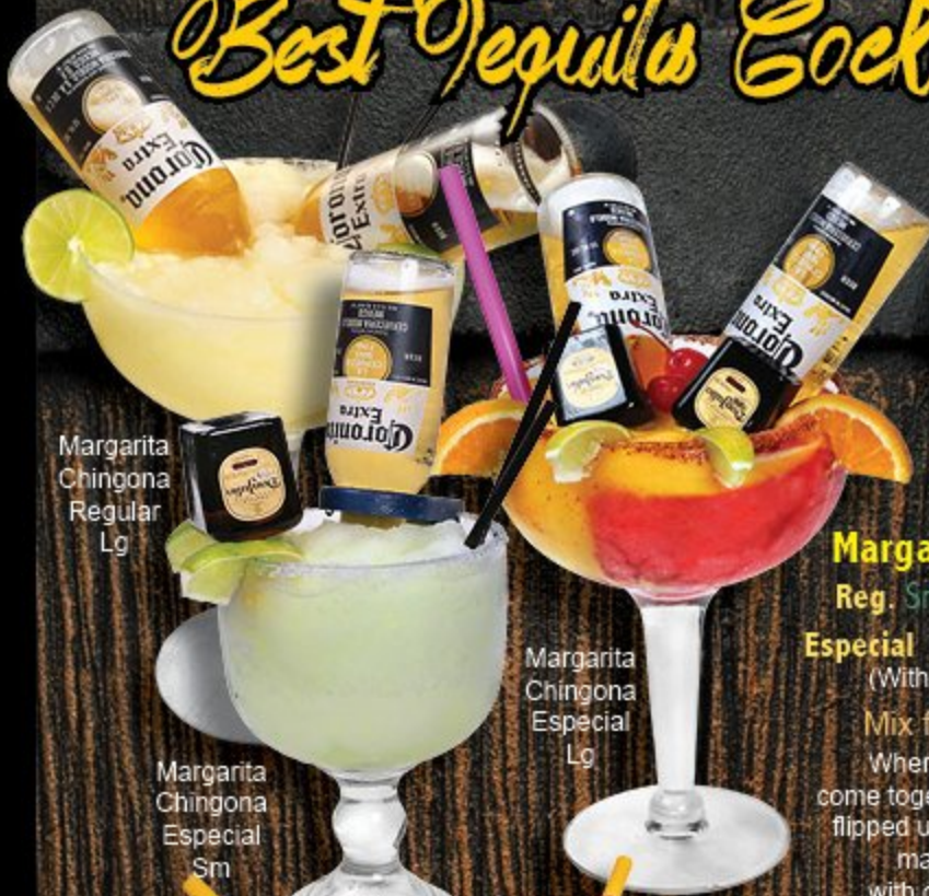
Margarita Chingona Regular Lg