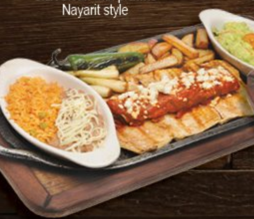
Pechuga a la Tampiqueña 24 95 Chicken breast served w/ 1 enchilada, guacamole, rice, beans, and grilled jalapeño pepper