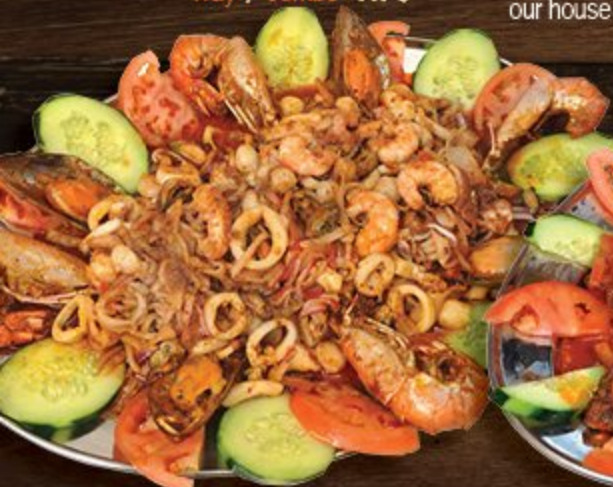
Charola del Mar Sm 44 95 Lg 79 95 Combination of prawns, mussels, shrimps, oysters, octopus, & surimi