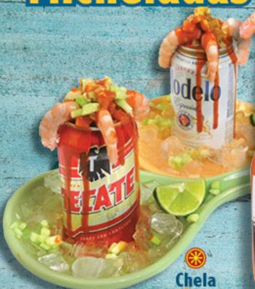
Chela Cabrona 9.95