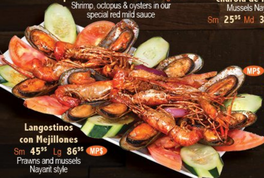
Langostinos con Mejillones Sm 45 95 Lg 86 95 MP$ Prawns and mussels Nayarit style