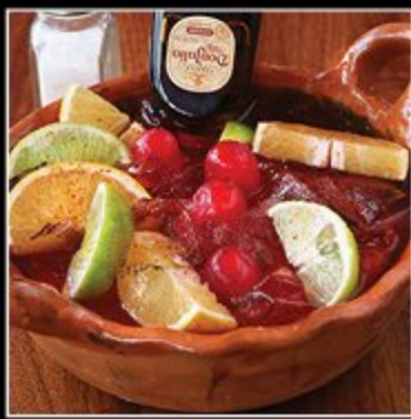
Cazuela Reg. 17 95 Especial 24 95 Tequila with mix of citrus soda, fresh juices and slices of fruit