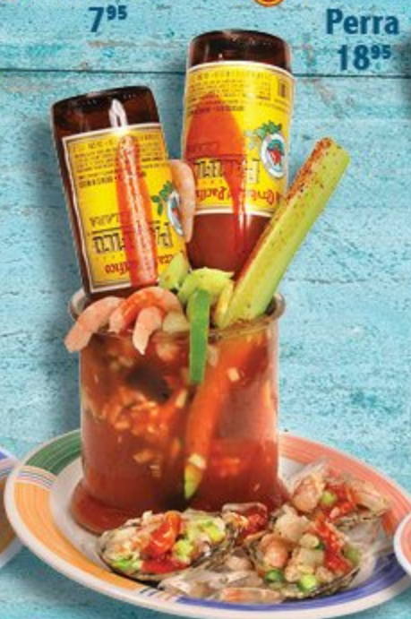
La Reina del Pacífico 27.95