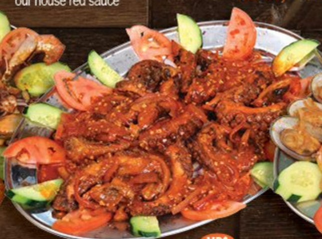
Pulpo Encabronado 39 95 MP$ Octopus stripes in a spicy guajillo & huichol sauce