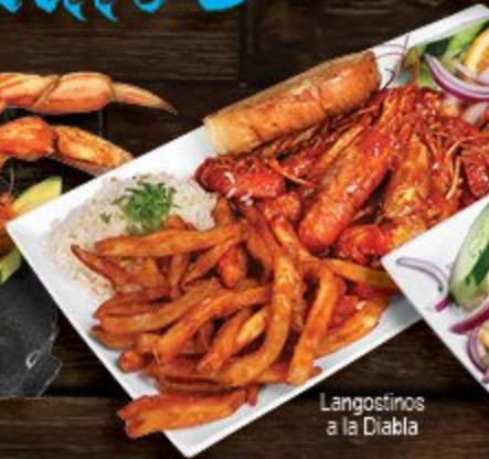
Langostinos a la Diabla

Molcajete Maguey 33 95 MP$ Served with prawns, mussels, crabs, camarones cucaracha and chapuzón