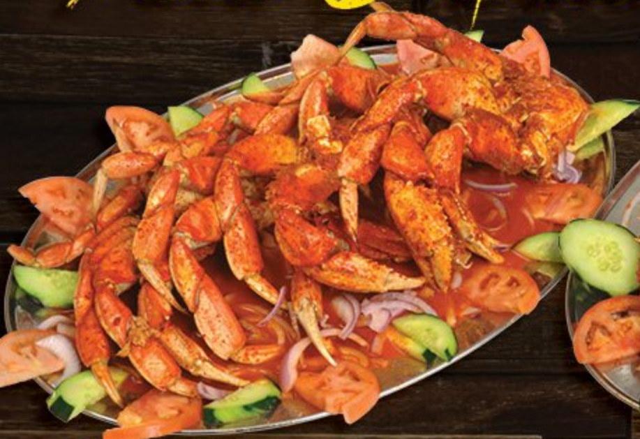
MP$ King Crab Legs (SEASONAL) Tray / Jumbo MP$