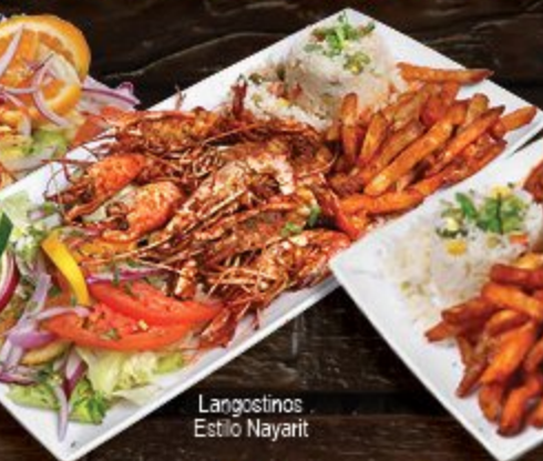
Langostinos Estilo Nayarit