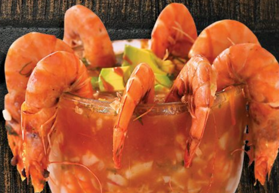
Levanta Pasiones (served warm)

☉ Levanta Pasiones (Served warm) Lg 26 95 Oysters, surimi, chopped shrimp an octopus garnished with large shell-on shrimp