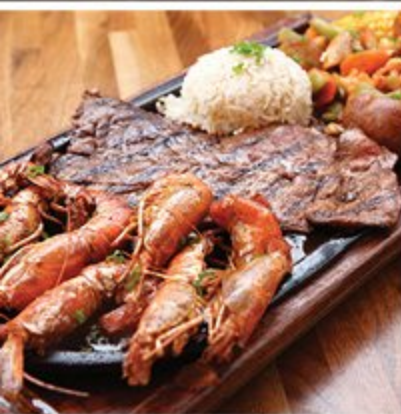
Carne Asada ☼ Con Langostinos 43 95 Skirt steak with prawns Nayarit style