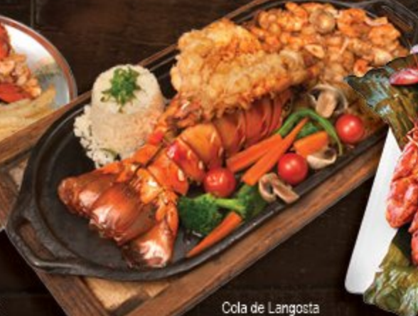
Cola de Langosta Rellena de Mariscos

LANGOSTA RELLENA DE MARISCOS (Entera o Cola) WHOLE 78 95 TAIL 89 95 MP$