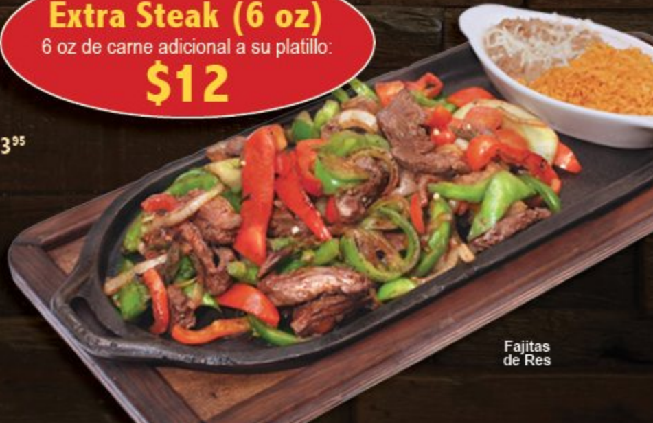
Fajitas de Res