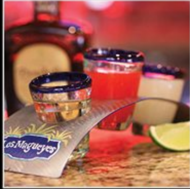
Banderita 15 95 Fresh lime juice, tequila and sangrita