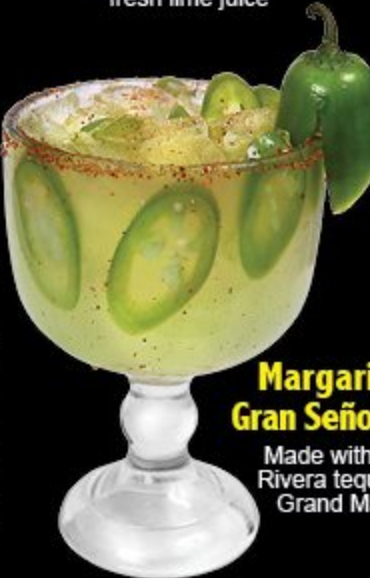
Margarita La Gran Señora 20 95 Made with Jenny Rivera tequila and Grand Marnier