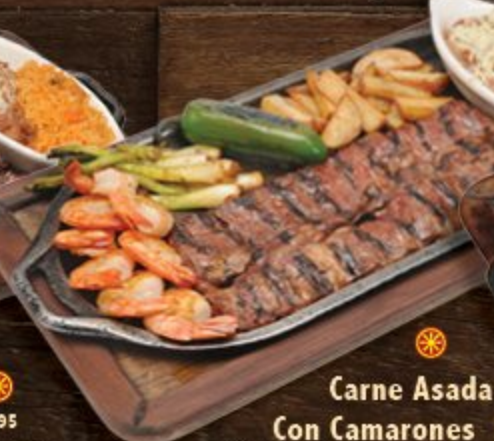
Carne Asada ☼ Con Camarones 35 95 Char-broiled steak with your choice of: grilled shrimps or butter-garlic sauce shrimp