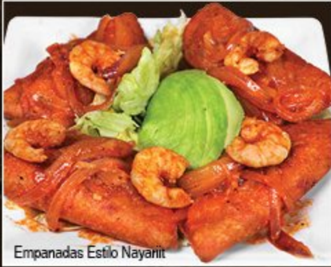
Empanadas Estilo Nayarit