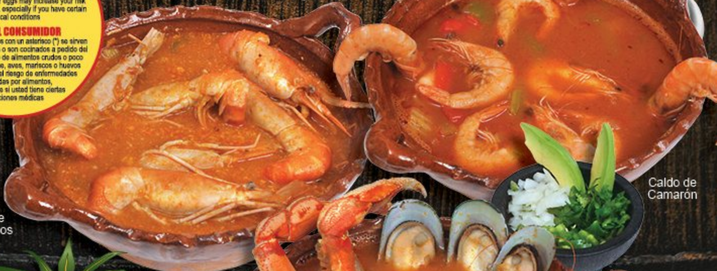
Caldo de Langostinos

Los artículos marcados con un asterisco (*) se sirven crudos, poco cocidos o son cocinados a pedido del cliente. El consumo de alimentos crudos o poco cocidos como carne, aves, mariscos o huevos puede aumentar el riesgo de enfermedades transmitidas por alimentos, especialmente si usted tiene ciertas condiciones médicas