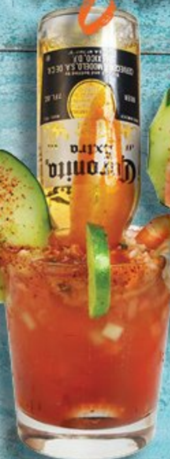
Ocho Loco 7.95