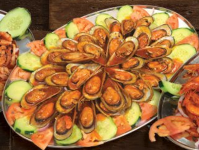
Charola de Mejillones Mussels Nayarit style Sm 25 95 Md 39 95 Lg 72 95