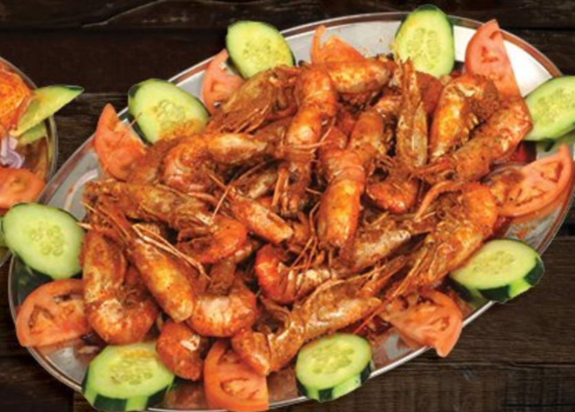
Langostinos Estilo Nayarit Prawns Nayarit style with our house red sauce Half Tray 34 95 • Full Tray 65 95 • Jumbo 129 95 MP$