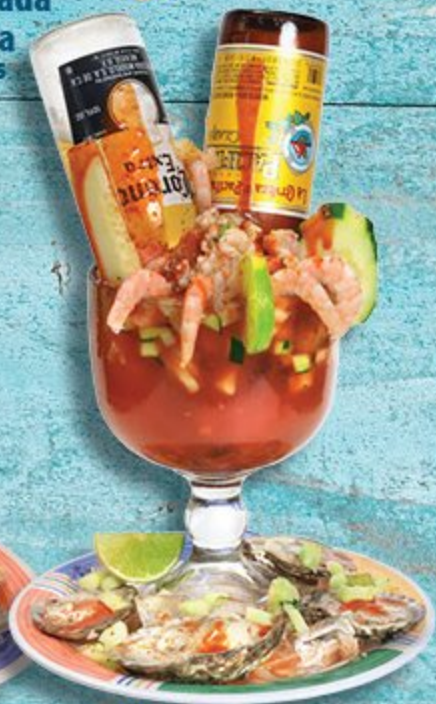
El Señor de los Cielos 27.95