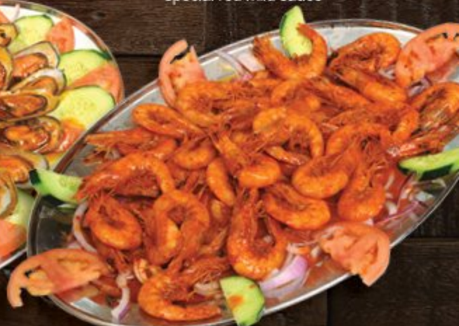
Camarones Cucarachas Deep fried shelled shrimp in our hot Huichol sauce In their shell 39 95 Peeled 45 95