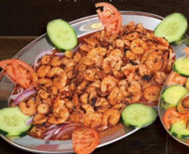
Chapuzón del Mar Sm 39 95 Lg 76 95 Shrimp, octopus & oysters in our special red mild sauce