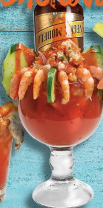
Michelada Perra 18.95