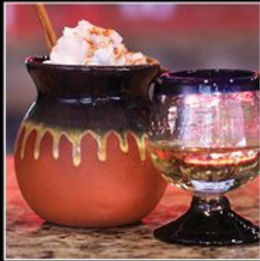
Café Mexicano 9 95 Mexican style coffee with a shot of tequila