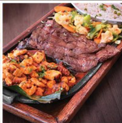
Carne Asada ☼ Con Chapuzón 43 95 ☼ Skirt steak with seafood mix Nayarit style (Chapuzón)