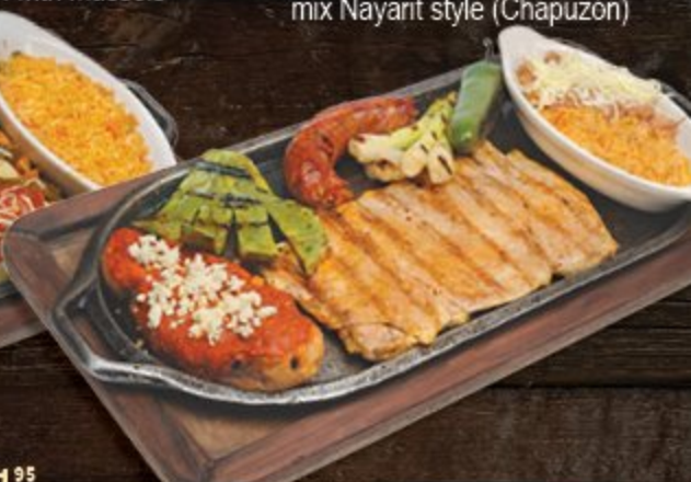
Pechuga Maguey 25 95 Chicken breast served with grilled nopal-cactus, Mexican sausage and a stuffed Poblano pepper