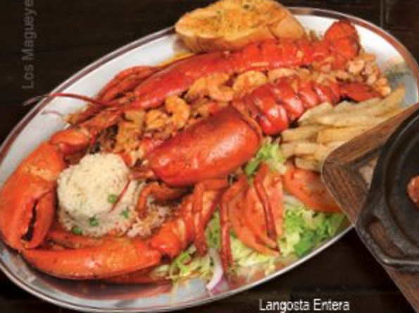
Langosta Entera Rellena de Mariscos