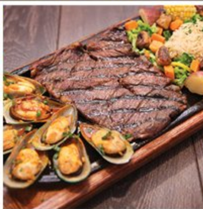
Carne Asada ☼ Con Mejillones 39 95 Skirt steak with mussels