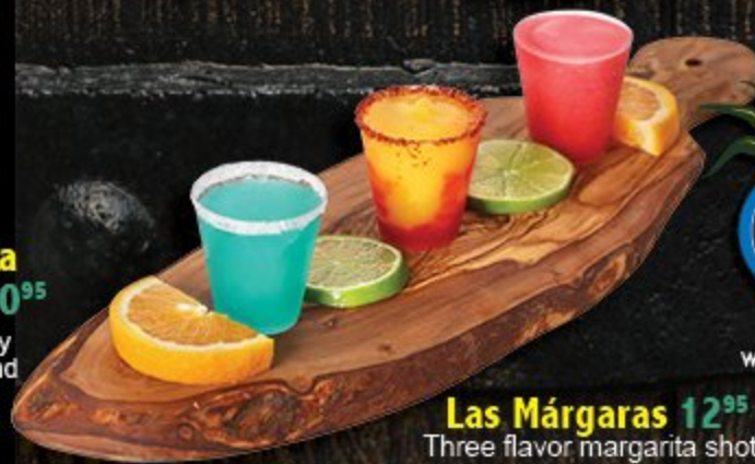
Las Márgaras 12 95 Three flavor margarita shots made with house tequila