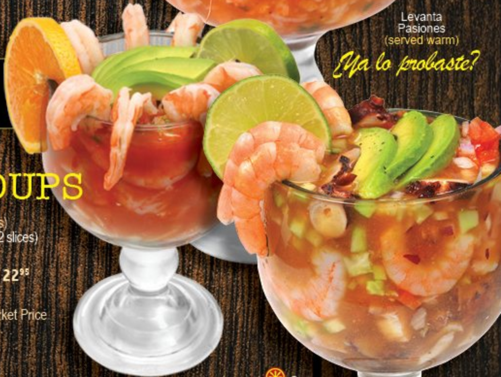
Coctel de Camarón